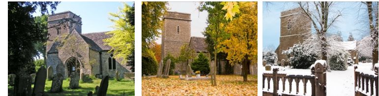
St. Margaret's Stratton